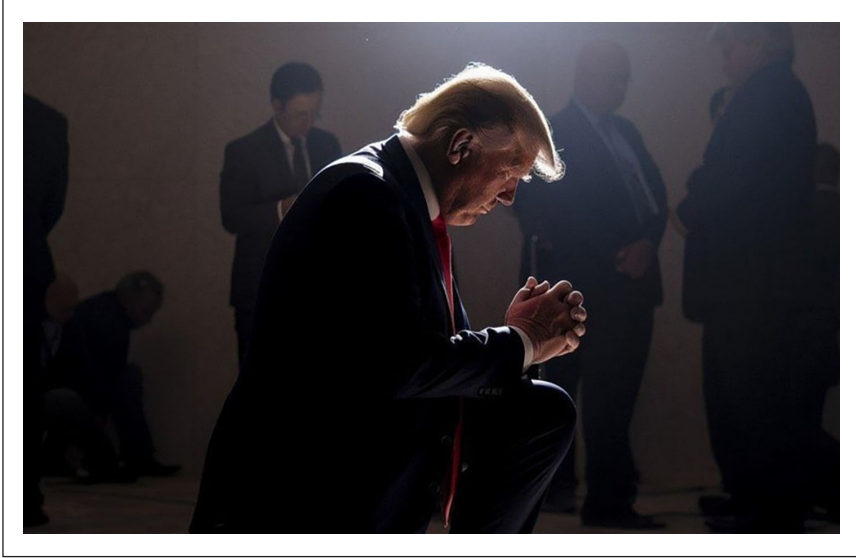
Figure 3. An AI-generated image of Trump praying, re-shared by Trump’s Truth Social account in March 2023.