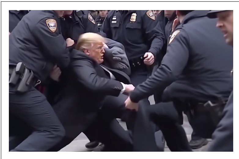
Figure 2. A second AI-generated image of Trump’s could-be arrest, made by Eliot Higgins using Midjourney and shared to Twitter (X) in March 2023.

These images represent an early flashpoint in what became a heated public struggle over the meaning of Trump’s criminal convictions, particularly vis-à-vis the predicament